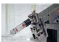
SensApex' first product is a remote-controlled and ultracompact micromanipulator.

Analysis of biomolecular interactions were also discussed. Markku Kulomaa, Ph.D., of the University of Tampere presented new types of avidins, a chicken-derived protein used widely as a probe in the study of biological macromolecules. Both avidin and its bacterial analogue, streptavidin, have been modified by mutagenesis for improved properties.